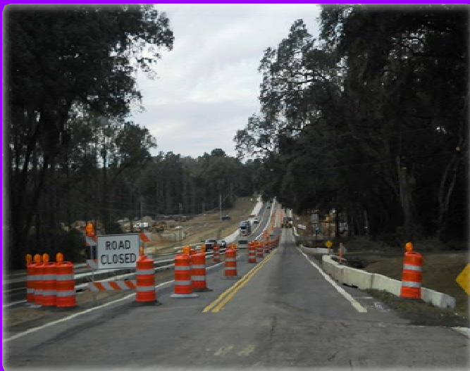
Recent Traffic Switch