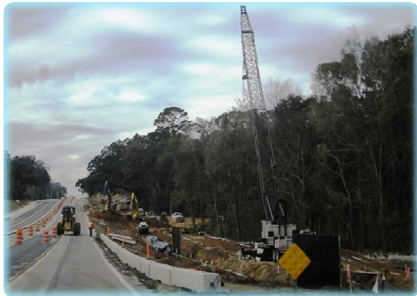
Construction of the Retaining Wall