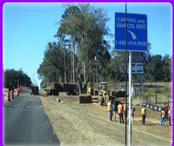
Installation of Sod